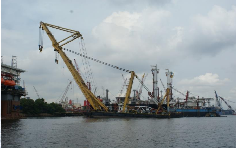
The existing Asian Hercules which will be replaced